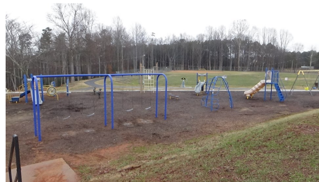
View of the playground showing one of the ballfields in the background