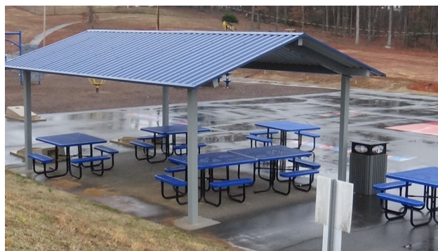
Covered picnic area on the playground