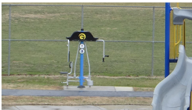
Exercise station along the walking trail

In addition to capital improvement projects, the Parks and Recreation staff member are also working to grow the number of programs offered. Over the last year, they added a youth art class, Barre and Pilates classes, and youth indoor soccer. In addition to these programs, the town offers playgrounds, camps, fitness training, gymnastics, pickleball, Pound exercise, swimming, free play, senior meals program, senior cards, tennis, walking track/trails, and Zumba exercise. In 2022, the William B. Shuford Recreation Center hosted the following events: the 8th Annual Veterans Day ceremony, the annual Caldwell County Special Olympics Polar Plunge, the Tarheel Swim League Conference Tournament, and Art in the Park. Parks and Recreation staffers assisted with the Festival on Main, Festival on the Square, and the Christmas Parade. In addition to the William B. Shuford Recreation Center on Pinewood Road, the Parks and Recreation Department includes Lakeside Park on Lake Rhodhiss with a picnic shelter, fishing pier, and walking trails and Neighborhood Park on the corner of Chestnut Street and Sterling Avenue with a tennis court, basketball court, and children’s playground. For more information about their programs, go to www.granitefallsnc.com/recreation and “Granite Falls Parks & Recreation” on Facebook.