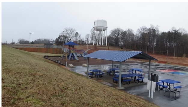
View of the playground showing the site of the new parking lot in the background